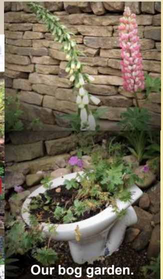
Our bog garden.