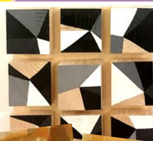
Artwork on display