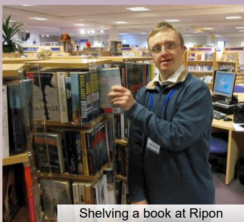
Shelving a book at Ripon